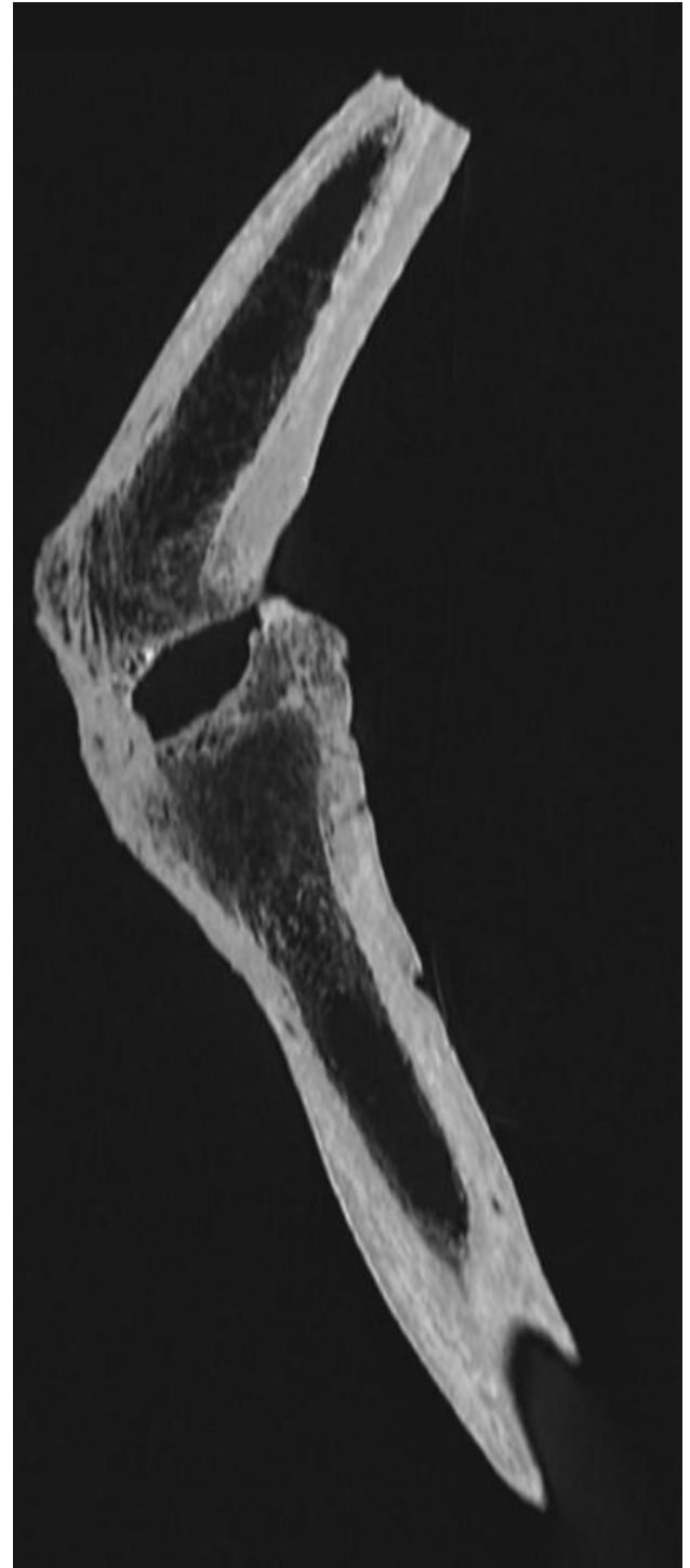
Figure 4. Part of the upper and lower right leg (femur and tibia), completely fused CT imaging

Part of a right femur and tibia were preserved with a partially ankylosed knee joint in the lateral compartment. The knee was bent in a flexed position at 45^\circ degrees. Unfortunately, due to the large number of individuals buried in this grave (Minimal Number of Individuals was 7), as well as it was the case of the commingled remains, it was not possible to determine whether any other bones from this assemblage belonged to the individual who had this pathological change, and consequently, neither the sex nor age at death could be estimated. Based on closed epiphyses and cortical thickness, we concluded that the knee