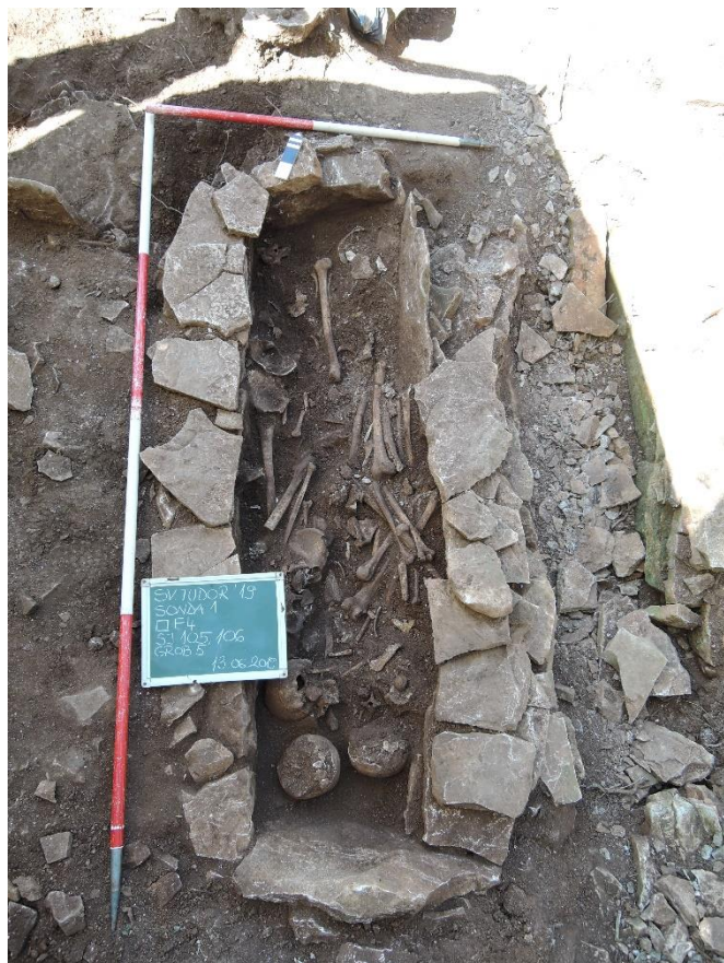
Figure 1. Excavations carried out in AD 2019 on grave 5

century) scanned on X-ray and CT, and provide an overview of 3D reconstructions on CT.