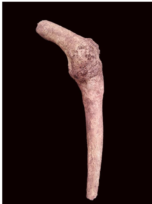
Figure 2. Part of the upper and lower right leg (femur and tibia), completely fused

The fused right knee has been scanned in University Hospital Centre Zagreb on Axiom Aristos MX (Siemens, Erlangen, Germany) X-ray unit and Multidetector computerized tomography (MDCT). CT scans were obtained using a Siemens Sensation 16 unit (Siemens, Erlangen, Germany) with the following scan