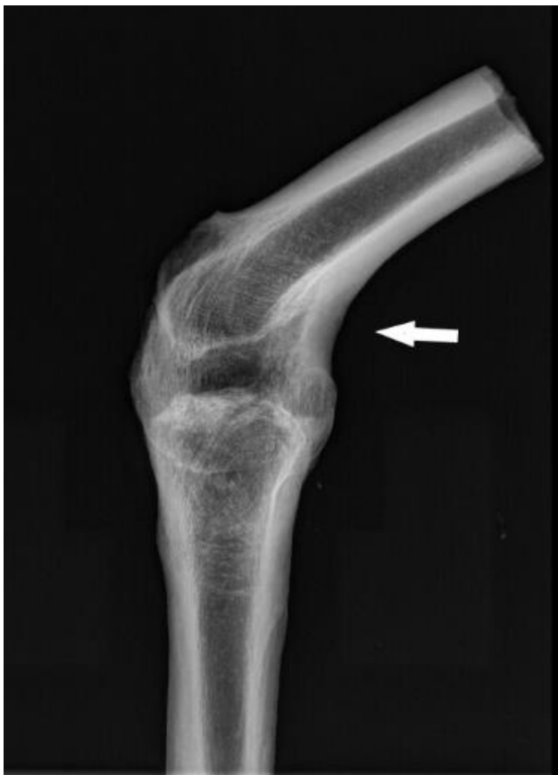
Figure 3. Part of the upper and lower right leg (femur and tibia), completely fused x-ray

parameters; 16 \times 0.75 mm collimation, 130 KVP, and 300 mAs with a field of view (202 mm). Post-processing (3D volume rendering technique - VRT) and multiplanar reconstructions (MPR) were done using imaging processing software (Horos MD v. 8.1.5. Pixmeo Software, Geneva, Switzerland).