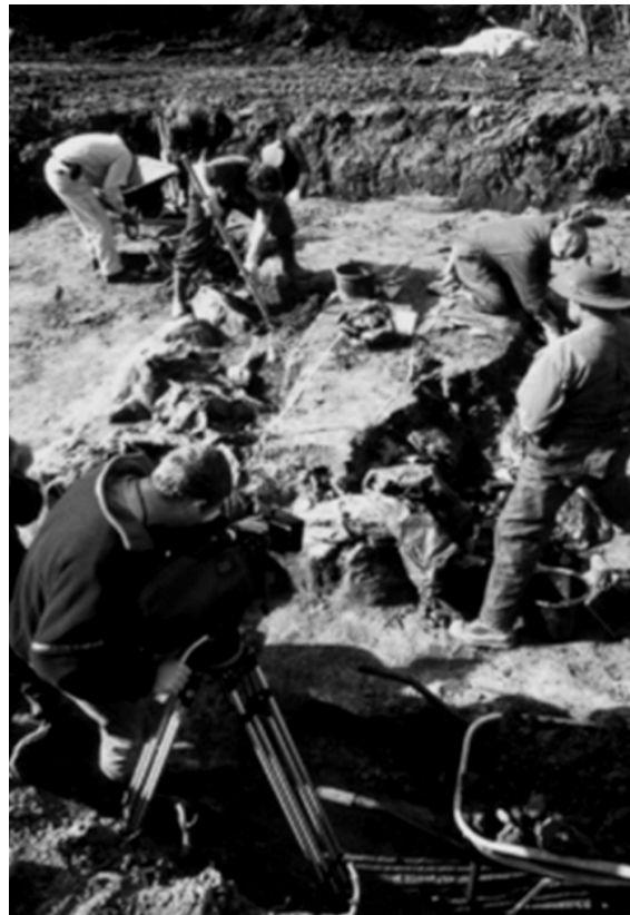
Figure 11. The PHR team manually removes earth from the Ovčara grave [36] (reproduced with permission).

The exhumation began by removing the topsoil mechanically. The black film that was utilized by the first team of forensic experts to protect the skeletal remains from the test trench upon completion of the preliminary investigation in 1992 was uncovered on the third day [36]. The exhumation carried on by manual digging and other archaeological methods to preserve the bodies and evidence [39] (Figure 11).