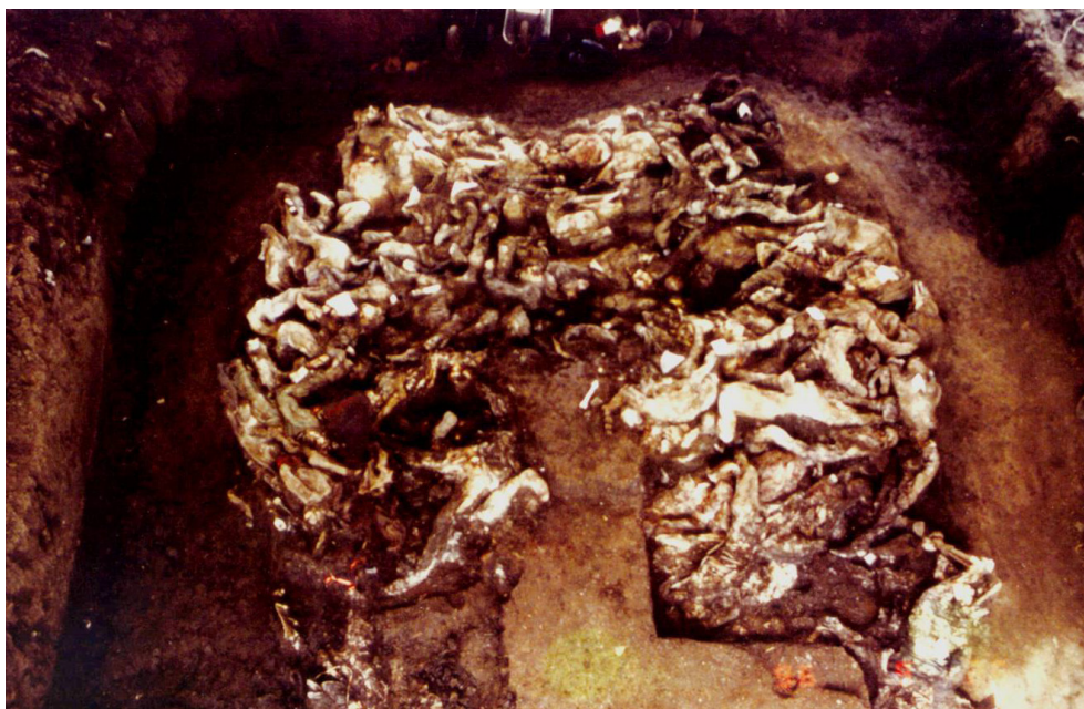
Figure 13. Entwined bodies in the Ovčara mass grave [24] (reproduced with permission).