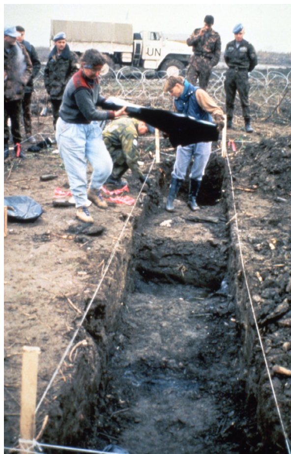
Figure 8. The preservation of bodies from the test trench during the preliminary investigation of the Ovčara mass grave [36] (reproduced with permission).

The preliminary investigation produced detailed documentation on the findings from the exhumation site, exhumation methods, and examinations of the bodies, which was supplemented by hand-drawn sketches as well as photo and video recordings [37] (Figure 10). Following the preliminary investigation, the team's priority was to secure the crime scene; the site was cordoned off with two rows of concertina wire and UNPROFOR Russian Battalion (RUSBAT) guard stations were placed