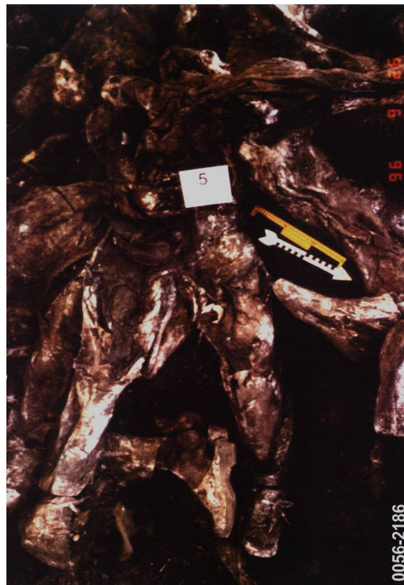
Figure 12. Entwined bodies dressed in civilian clothes and work wear and shoes [24] (reproduced with permission).

The first lot of exhumed remains was transported to the Institute of Forensic Medicine in Zagreb for further processing. The last of the 200 victims was exhumed on 4 October 1996 [36].