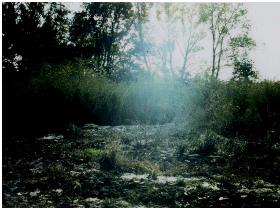
Figure 2. The location of the grave at the Ovcara farmland near Vukovar [24] (reproduced with permission).