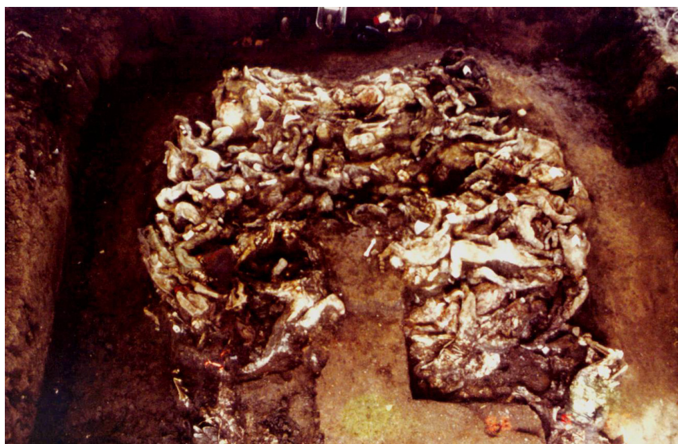
Figure 13. Entwined bodies in the Ovčara mass grave [24] (reproduced with permission).