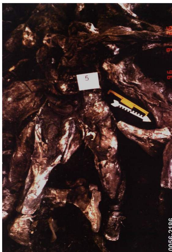
Figure 12. Entwined bodies dressed in civilian clothes and work wear and shoes [24] (reproduced with permission).

The first lot of exhumed remains was transported to the Institute of Forensic Medicine in Zagreb for further processing. The last of the 200 victims was exhumed on 4 October 1996 [36].