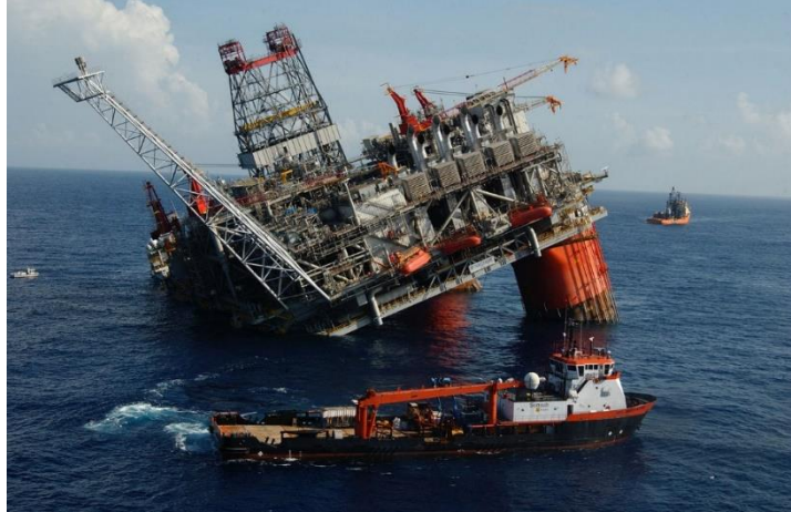
Picture 2. Illustration of the consequences of a security-compromised offshore facility (oil platform)