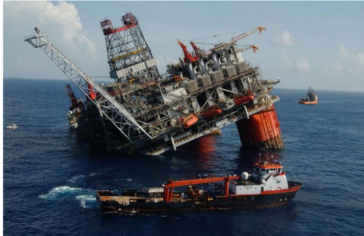
Picture 2. Illustration of the consequences of a security-compromised offshore facility (oil platform)