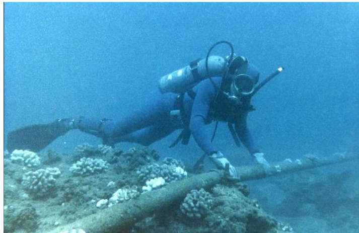
Picture 3. Diver during inspection of underwater cable

Sabotage activities of undersea cables can affect critical economic and financial national and interstate affairs. Also, undersea cables can be vulnerable to intelligence and espionage actions by states, groups, and individuals by compromising electronic data, and those activities are a threat to political stability and order of states and they can compromise international relations (DNI, 2017) ; (Matis, 2012).